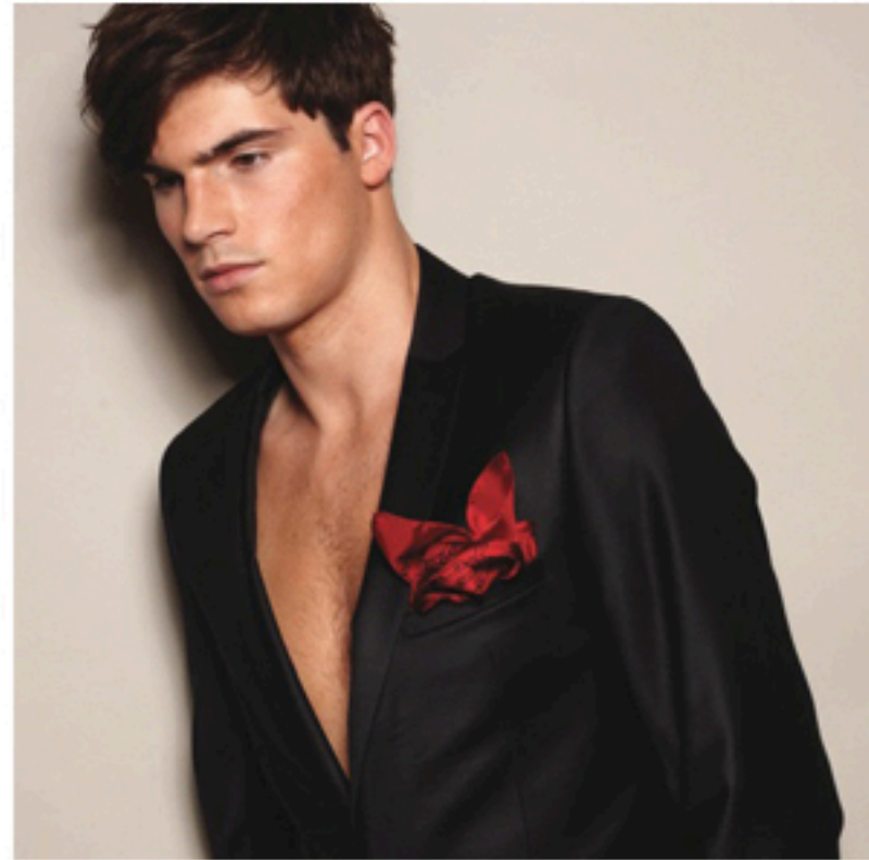
This pocket square from Jane Carr only fully reveals its clever print when unfolded.