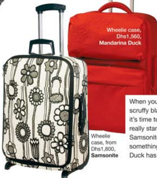
Wheelle case, Dhs1,560, Mandarin Duck