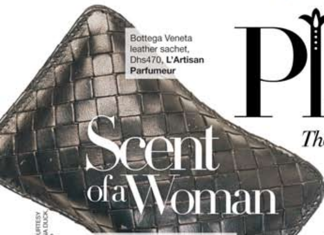
Bottega Veneta leather satchel, Dhs470, L'Artisan Parfumeur