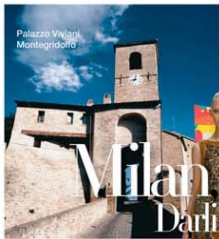
Palazzo Viviani, Montegrolfo